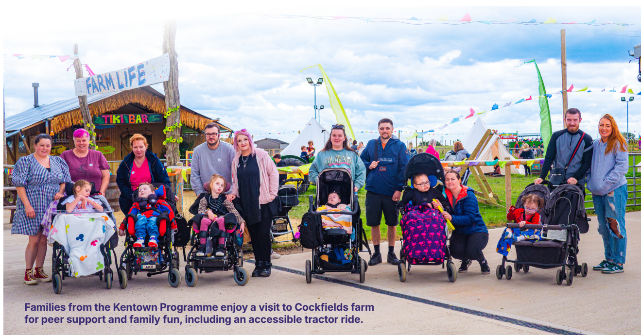
Families from the Kentown Programme enjoy a visit to Cockfields farm for peer support and family fun, including an accessible tractor ride.

The programme bridged critical gaps in care by fostering collaboration across services, enabling earlier, family-led advance care planning, and introducing a coordinated, family-focused approach that complements existing NHS, children's hospice, and voluntary sector support.