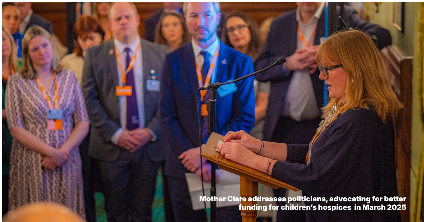
Mother Clare addresses politicians, advocating for better funding for children's hospices in March 2025