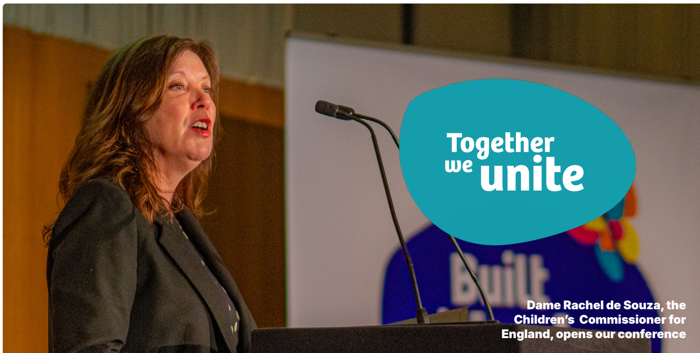
Dame Rachel de Souza, the Children's Commissioner for England, opens our conference

In 2025, we hosted our national conference, 'Built to Last: towards a strong, sustainable future', bringing together over 400 delegates, including researchers, professionals and students, alongside families with lived experiences, who all came together to share learning, showcase new models of care, and champion bold ideas for the future.