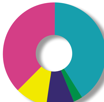
Distributions and Expenditure £6,595,638