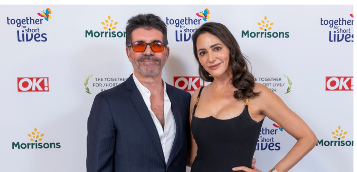
Left: The Cheshire Dash raised £33,000 for seriously ill children. Right: Simon Cowell has been a patron for 15 years